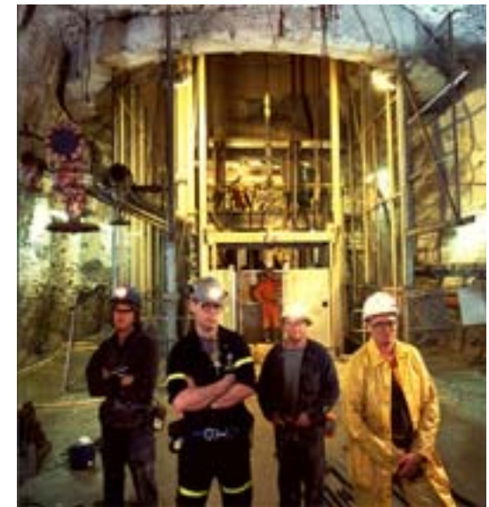
Underground shaft equipping