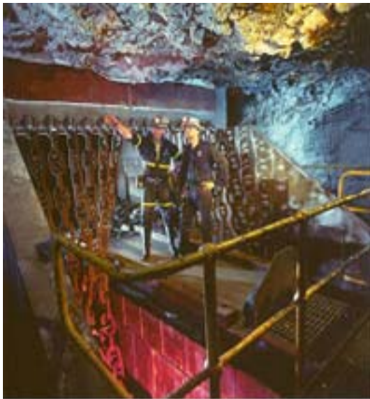
Crusher and conveyor

Installation - cost reimbursable / hourly rate